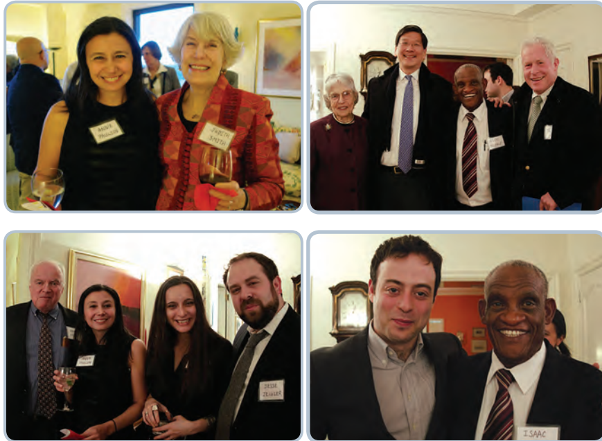
YPAB members at Kunstadter event.

We have many dedicated young professionals, most of them from New York City who are inspired by our work and willing to devote their time to help grow our network. We thank you all for your energy and kind heart.